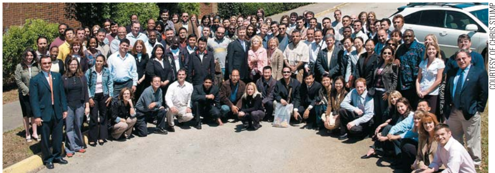
Physicians' Training Program participants and Operation Smile staff at the Norfolk headquarters

PTP is a joint effort by Operation Smile, Eastern Virginia Medical School, Children's Hospital of The King's Daughters, and Sentara Norfolk General Hospital. To date, Operation Smile has brought more than 650 medical professionals to Norfolk, Va., for PTP. Anesthesiologists and pediatricians attending the conference trained at Tidewater Center for Life Support to receive Advanced Cardiac Life Support (ACLS) and Pediatric Advanced Life Support (PALS) certifications, which are required to participate in Operation Smile medical missions.