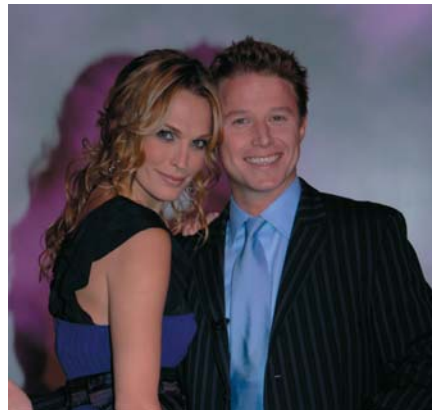
Co-hosts Molly Sims and Billy Bush