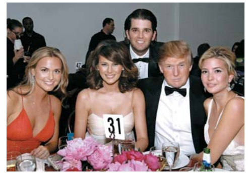
The Trump family, (from left) Vanessa, Melania, Donald Jr., Donald and Ivanka