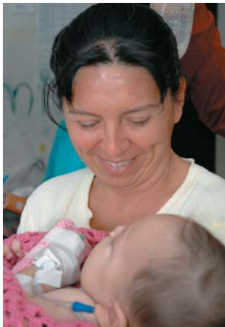
A mother smiles at her son after seeing him come out of surgery with a restored smile

An international team of more than 50 Operation Smile medical and non-medical volunteers from Australia, Brazil, Colombia, Ecuador, the United States and Venezuela worked