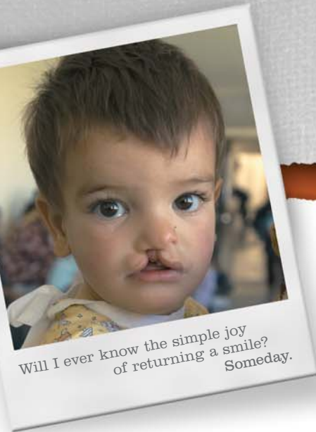
Will I ever know the simple joy of returning a smile? Someday.