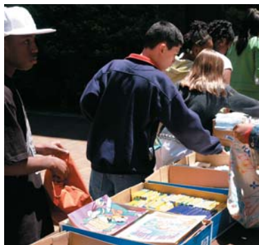
Students from Lafayette-Winona Middle School assemble "Smile Bags" for the Brazil mission

On May 19, nearly 200 sixth grade students from six Norfolk public schools met and had an opportunity to interview physicians from Egypt, India, Italy, Morocco, Panama, Peru and the Philippines. The physicians were in Norfolk to participate in Operation Smile's Physicians' Training Program. "World Tour Student Day" was held at Eastern Virginia Medical School and gave students an opportunity to learn about volunteerism, geography and healthcare.