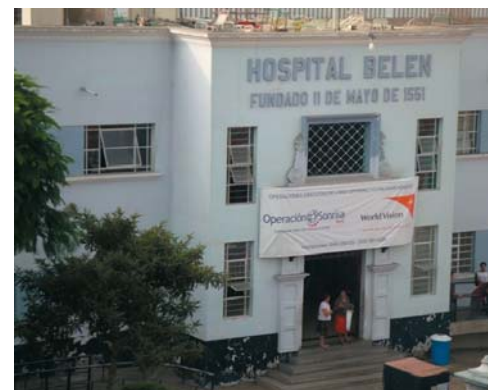
Operation Smile Peru partnered with World Vision to conduct a local mission at Hospital Belen in Trujillo

consults with parents about their children's eating habits. Similarly, a speech therapist and psychologist conducted one-on-one consultations. Two staff members and a nurse from World Vision Peru joined the Operation Smile Peru volunteers and staff. The staff members helped with the smooth execution of the mission and the nurse helped to run the post-operative ward. World Vision also sponsored the lodging for the Operation Smile team. The medical team provided 48 patients with free cleft lip and cleft palate surgeries. One week after the mission, World Vision helped provide transportation for the children to come back for post-operative check-ups. Operation Smile Peru plans to continue this partnership with World Vision in Trujillo next year.